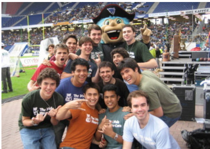
The Cats after singing at an NFL Europe football game in Hamburg, Germany