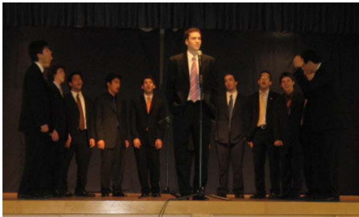
Entertaining a crowd of teachers and students at an elementary school in Hilo, Hawai'i