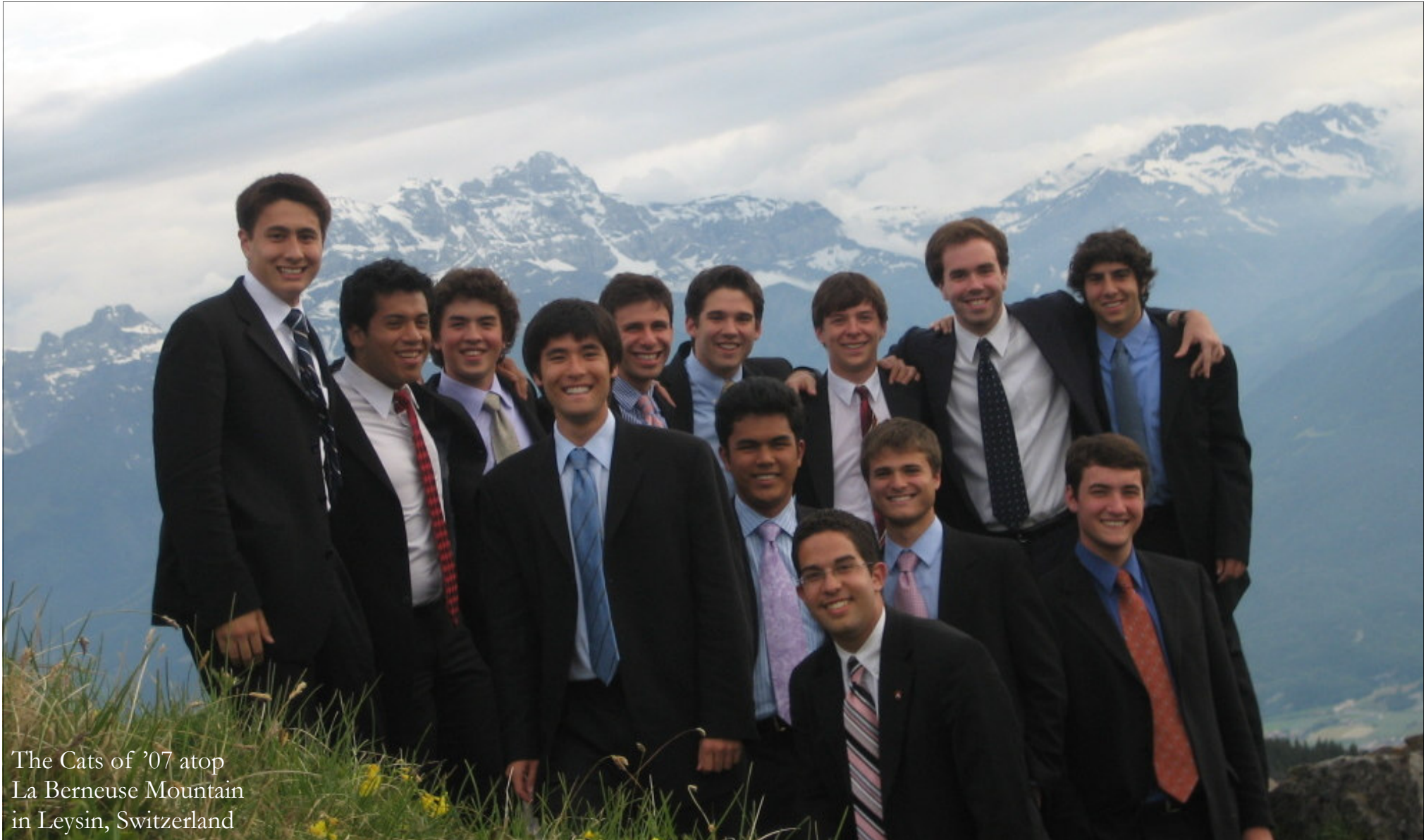
The Cats of '07 atop La Berneuse Mountain in Leysin, Switzerland

Telephone: (203) 436-0798 • Email: alleycats@yale.edu • http://www.yalealleycats.com