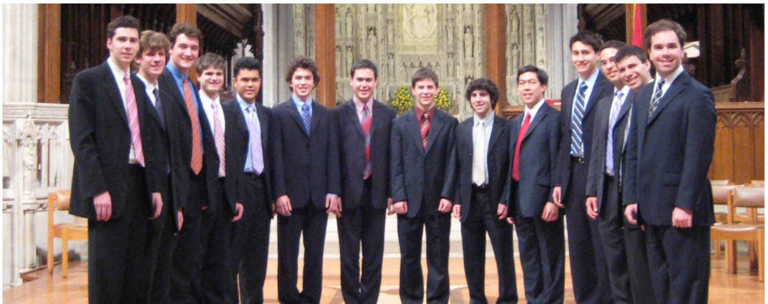
The Cats of '08 at the National Cathedral in Washington, D.C.

The choreography and humor we incorporate into our music make every performance truly unique. All this combined has entertained audiences across the world and even led the wife of the American ambassador to China to fall to her knees and join in a rousing rendition of “On the Street Where You Live.”