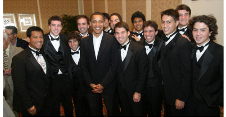
The Cats with U.S. Senator Barack Obama at a fundraiser in Boca Raton, Florida

This year promises to continue the experience. We are beyond thrilled to serenade audiences in Southern California in January, Brazil and Argentina in March, and Hawai'i and Asia in May and June. We hope that you will take part in our sixty-five year old tradition of song and brotherhood.